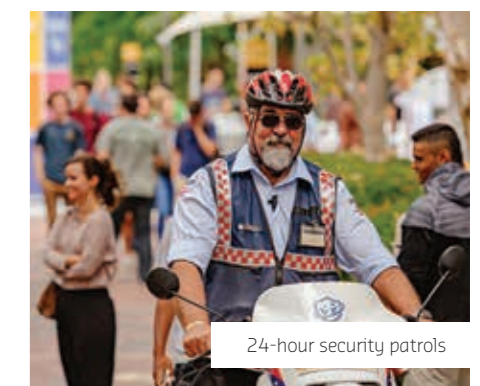
24-hour security patrols